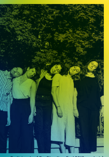
Participants of Re-Directing: East 2019 curatorial

We present selected performances from the intersection of contemporary dance, theatre and visual arts. We organise performances, workshops and artist residencies, meetings with artists, lectures and screenings of films about performing arts.